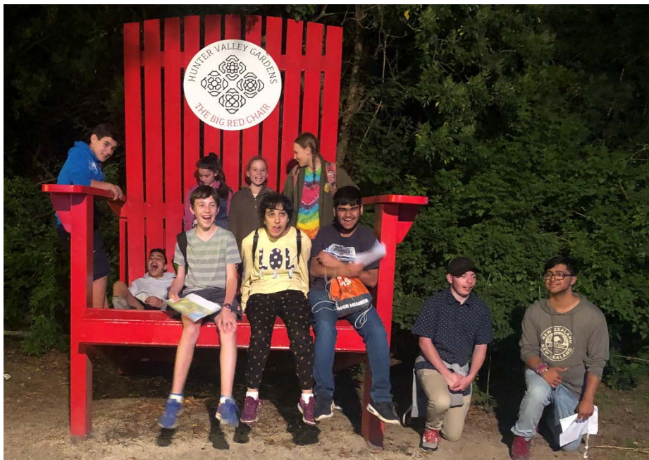
Some of our Support Unit students enjoying their excursion to the Hunter Valley Gardens