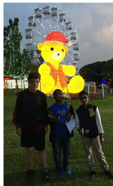
Some of our Support students enjoying the excursion to HVG to see the Christmas lights