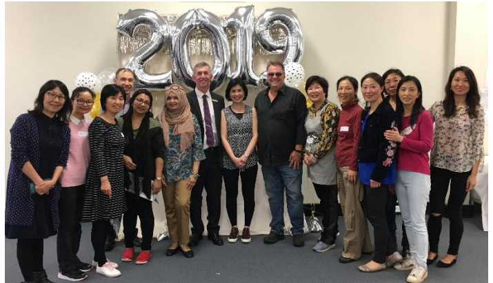
Our wonderful helpers setting up for the Y12 Graduation Morning Tea