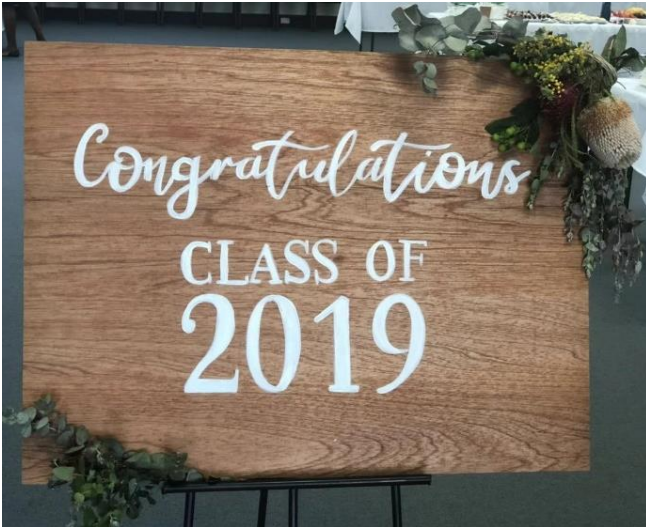
Our school community enjoying the Y12 Graduation Morning Tea