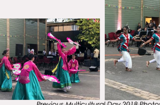
Previous Multicultural Day 2018 Photos