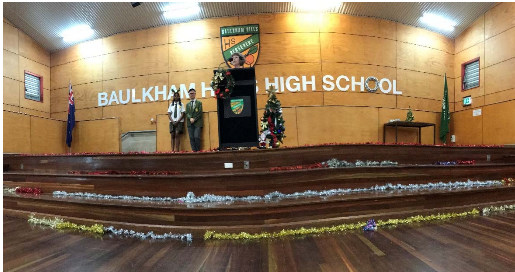
A little Christmas cheer at our school assembly this morning!

Cover: Christmas cheer at our assembly this morning!