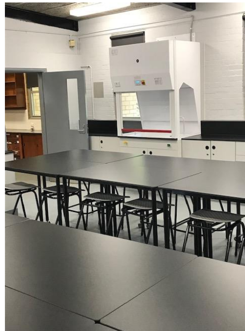
New Science Laboratories