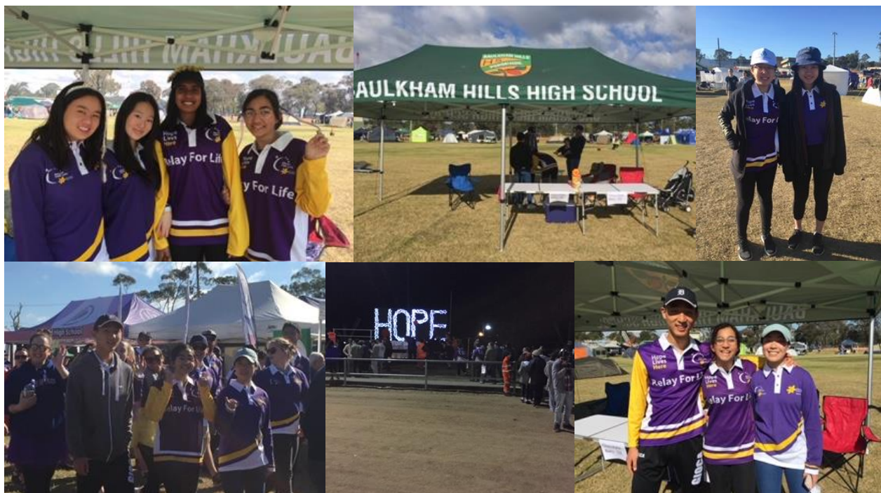
Relay For Life Photos from 2018