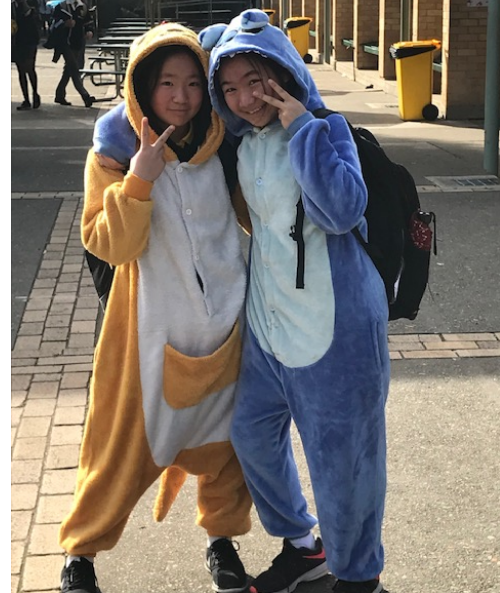
Our students participating in Green Group's "Enviroweek"