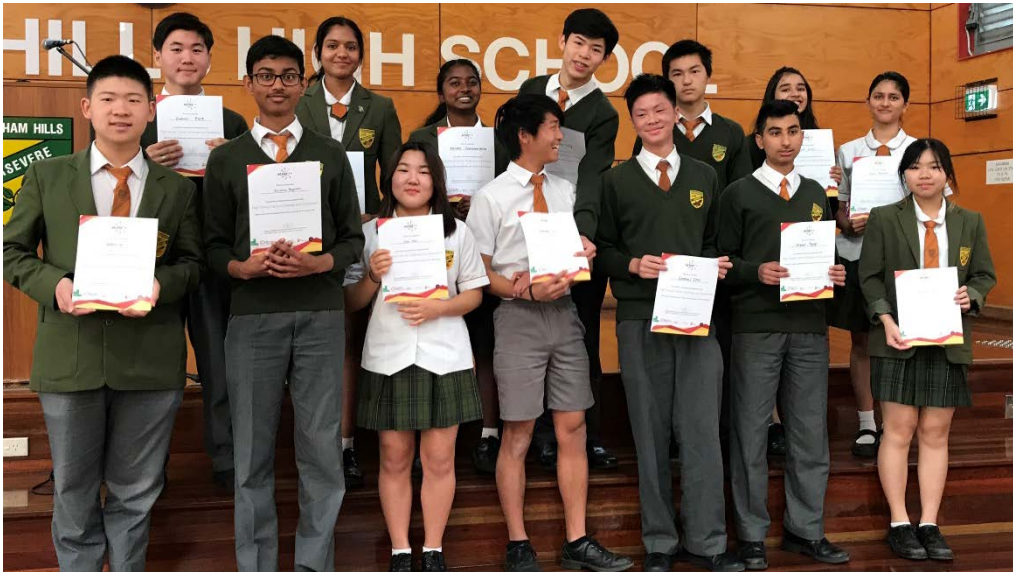
There were many high achievers in the High School Cancer Challenge & Symposium