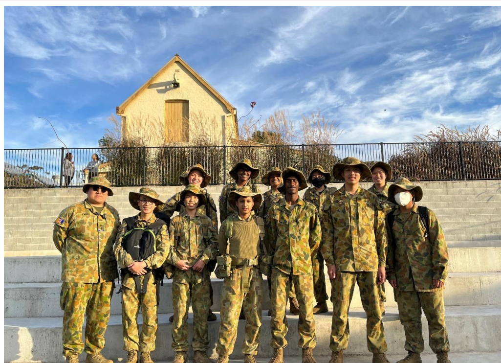
BHHSACU Joint Bivouac with JRAHSACU