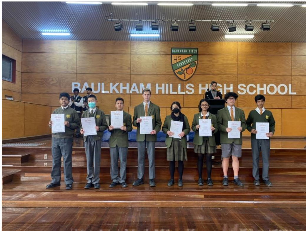
2022 Australian Geography Competition More Information on page 4