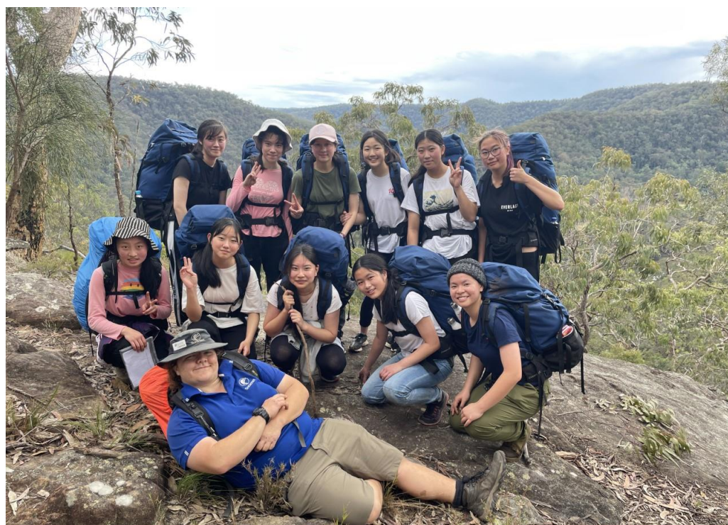
Year 10 Duke of Ed Camp More information following next week