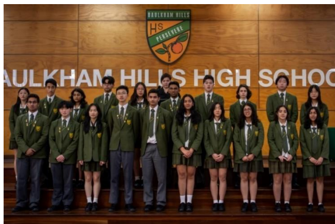
Prefects for 2022/23