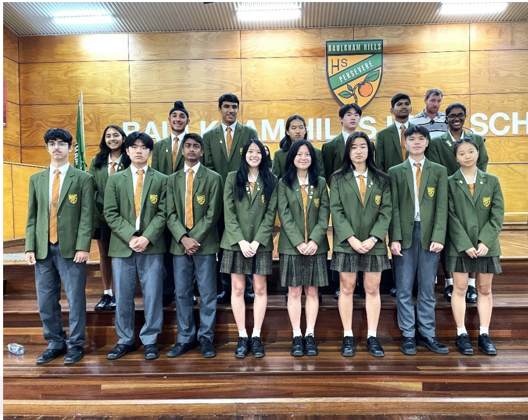
House Captains 2024 More information on page 6