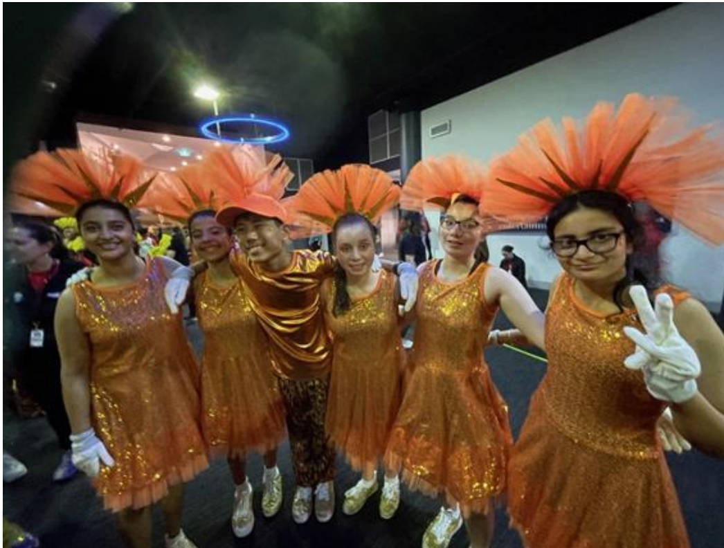
BHHS Support Unit representing the school in Schools Spectacular – More information coming next week