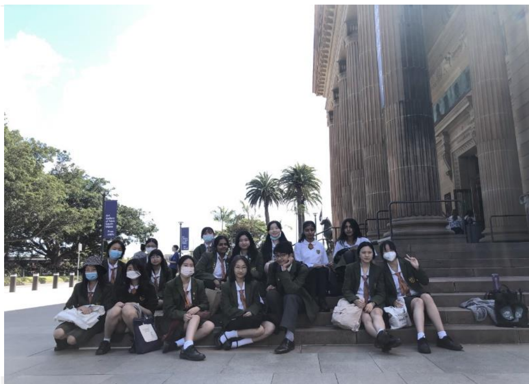
Art Gallery of NSW Excursion