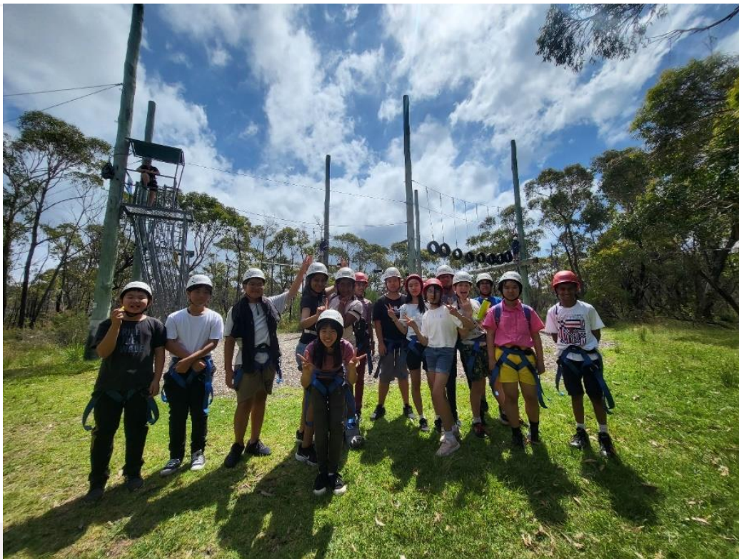
Year 7 Camp