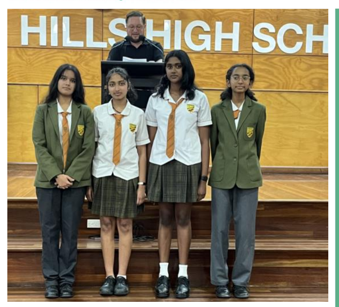
NASA Space Apps Challenge More information on page 7