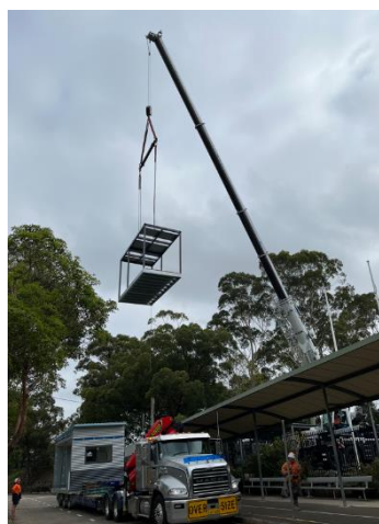
Student Wellbeing Hub In process