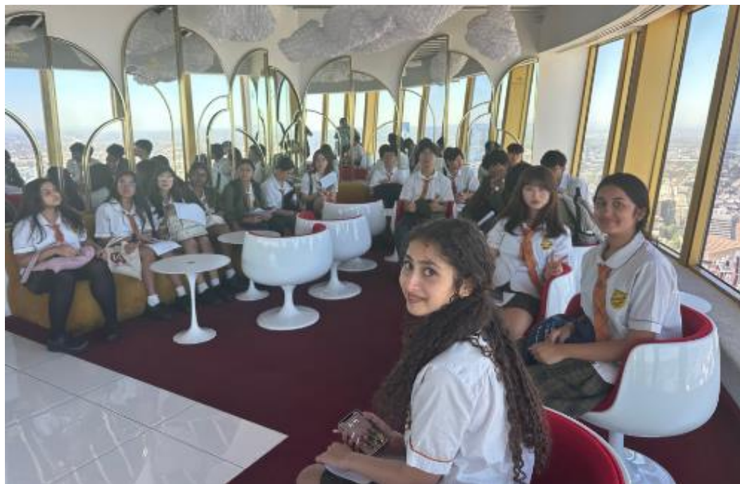
Year 10 Food Technology students at the Sydney Tower Dining School Tour