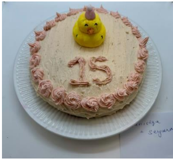
Mirza + Sejan