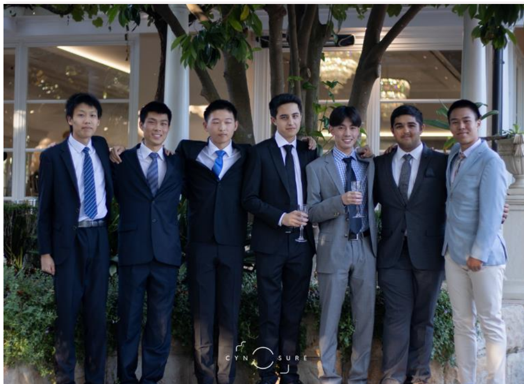
Year 12 Formal