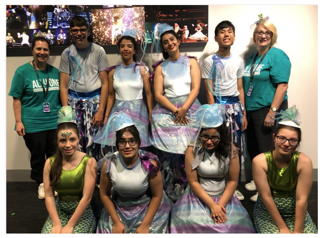
Our fantastic Support Unit students proudly represented BHHS in Schools Spectacular