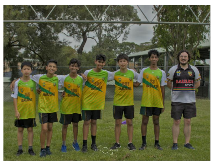
15's Touch Football A