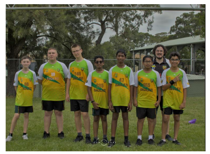
15's Touch Football B