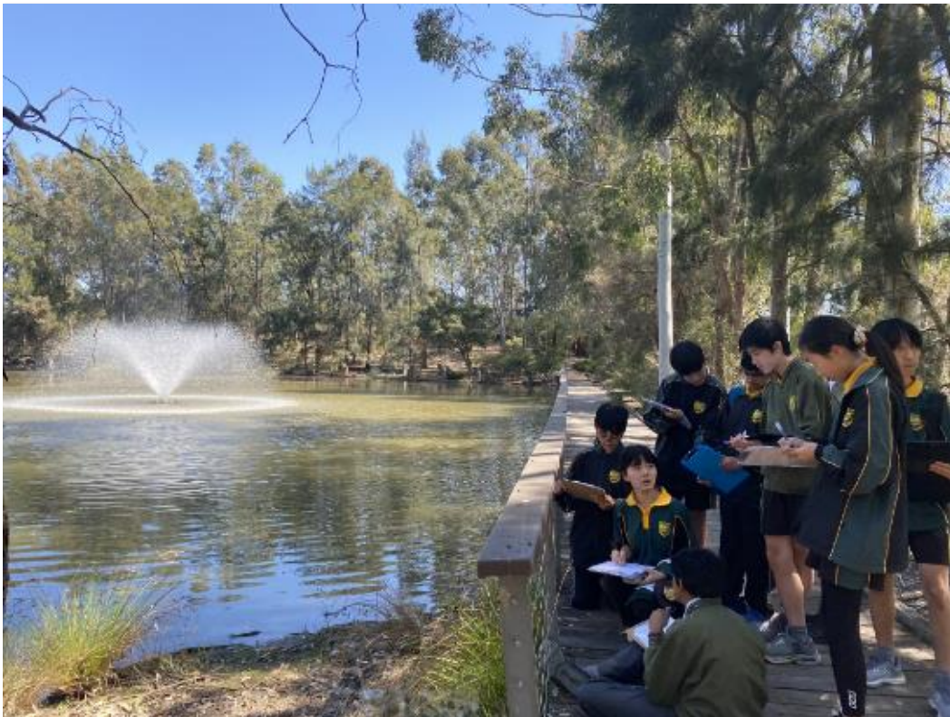
Year 7 Geography Excursion to Penrith Lakes