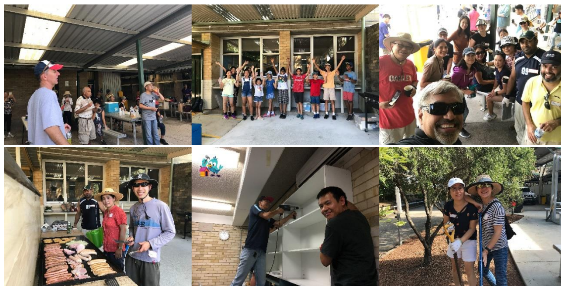
Images from Working Bee -1 earlier this year