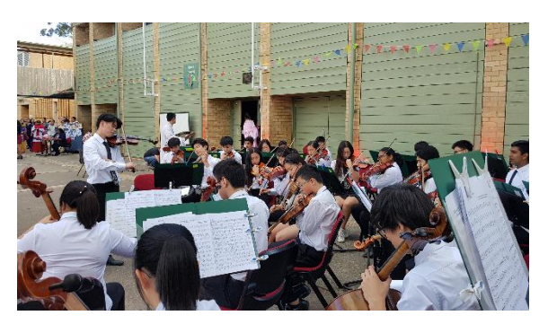
Band - Multicultural Night Photos