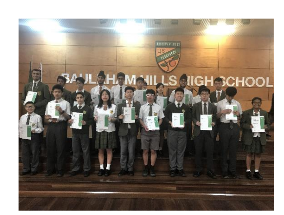
Recipients of Certificates from Science Olympiads